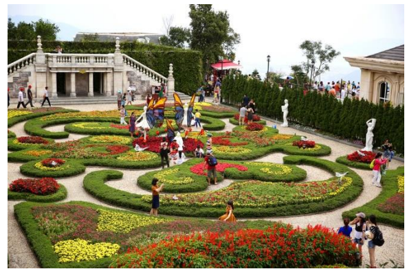
Le Jardin D'Amour Gardens

Continue to Le Jardin D'Amour Gardens where your private guide will help you discover the nine gardens of the area, the nine amusing tales and the nine varying architectures that harmonize together to form a beautiful visual sonata of beauty.